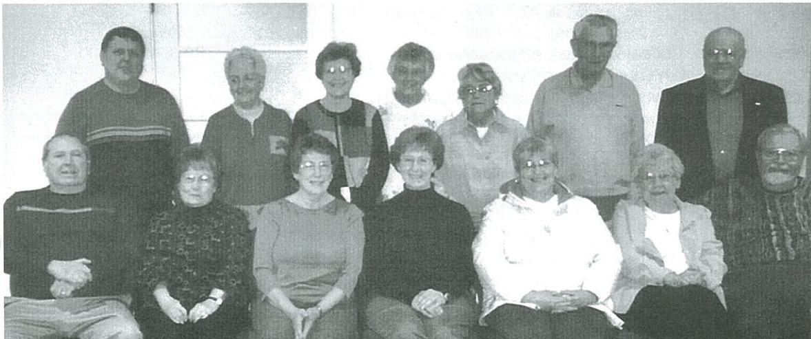
Left: Participants at the Annual Meeting who donated Mania Bucks.

Again, welcome to the new board members and thank you for your commitment to AHSGR.